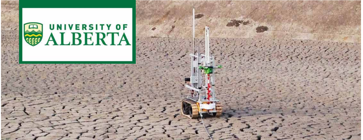
Husky UGV is equipped with an ice augger to drill into the surface of the tailings ponds to collect soil samples.