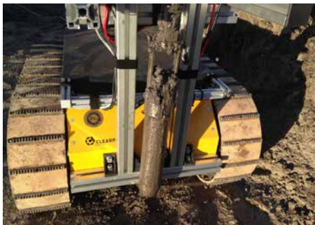
UofA and Copperstone Technologies outfitted Husky with heavy treads to handle the harsh environment.

Husky enabled Olmedo’s team to collect and analyze soil samples more